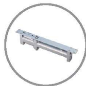
Concealed door closer