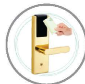
Electric Lock + Card